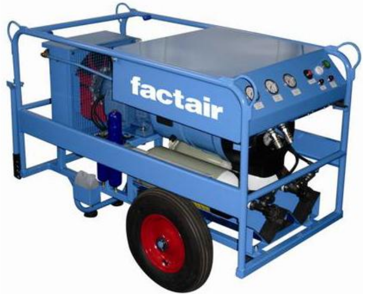
Above - BA20E which incorporates integrated alarm and fail safe reserve.

The BA20E also has a fully integrated automatic fail-safe emergency air back up and alarm system. In the event a drop in the primary air pressure an audible sounder will be activated and the air will continue be supplied from two 9-litre 200 bar (optional 300 bar also available) cylinders. The control panel has a status indicator which in the event of a failure of the primary air will automatically change from green to red and an LED light activated. If the air pressure in the HP cylinders drops below 140 bar this will also activate the alarm and an LED light on the control panel.