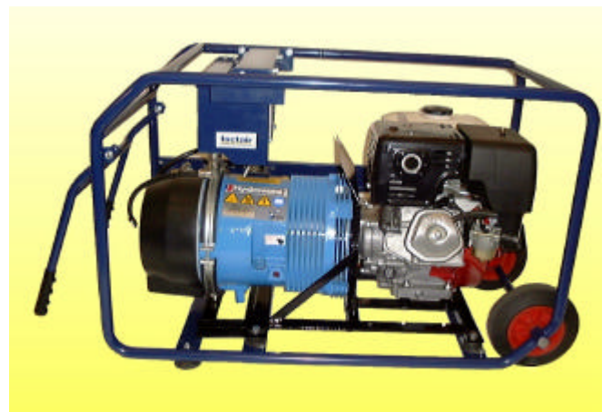
V04P fitted with aftercooler, filtration unit and compact inboard wheel kit.