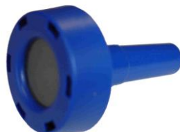
8103530 Draeger Oil Impactor