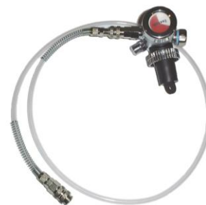
For connection to HP systems up to 300 bar F3002 High Pressure Regulator